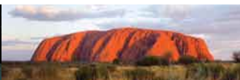
Uluru / Ayers Rock